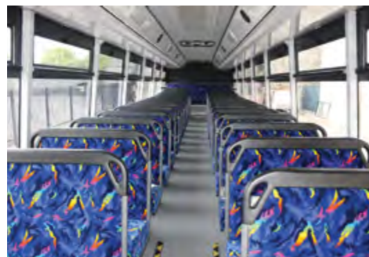
Customer choice of seats & fabric