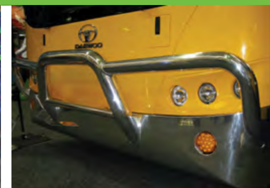
Bullbar or nudge bar