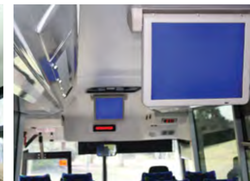
Radio/DVD Player with 17" TV Screens