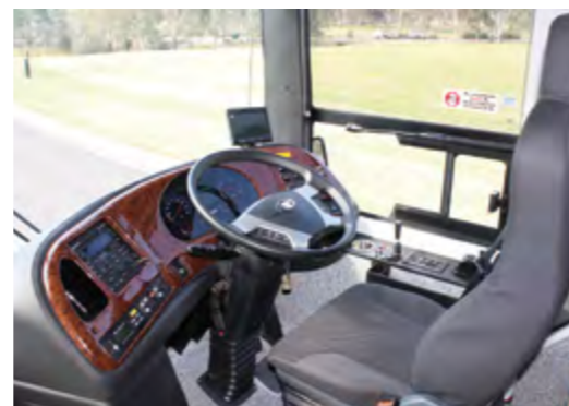
Ergonomically designed drivers area