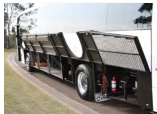
Full opening access panels & doors