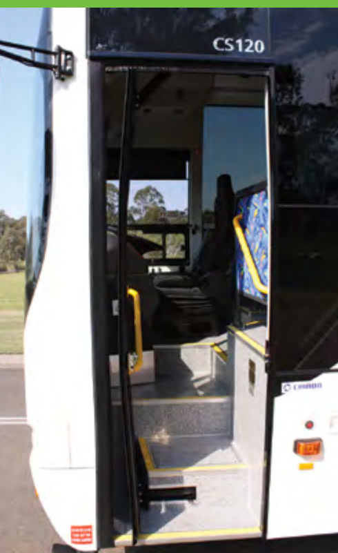
Passenger friendly entry with flush-gliding door