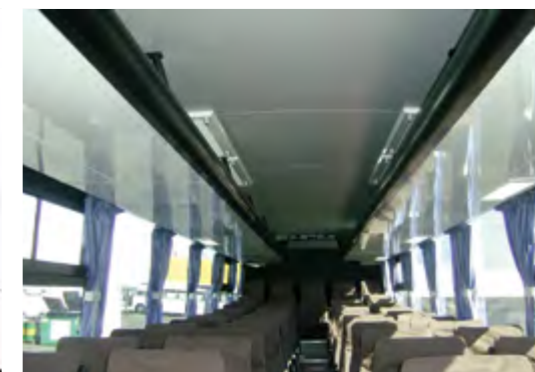
Full length parcel racks