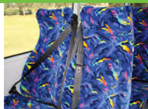
Seat belted seats