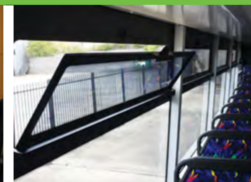
Top hopper style side windows